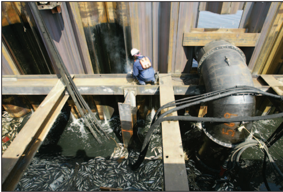
Dead fish in the floodwaters surround a worker as he repairs a levee in New Orleans.

On August 29, Destruction Day, the model shows the hurricane's northeasterly winds pushing a wall of water directly against the hurricane levees at the mouth of the Mississippi River, and then pouring over them. As the surge moves inland, it tops the hurricane levees that run toward the center of New Orleans. As Katrina moves toward Mississippi, the model shows a north wind pushing water in Lake Pontchartrain against south shore levees and into canals, where the rest of New Orleans floods as portions of the canal fail. Finally, the wave rises up 30 feet as it hits the Mississippi coast, where it causes massive destruction.